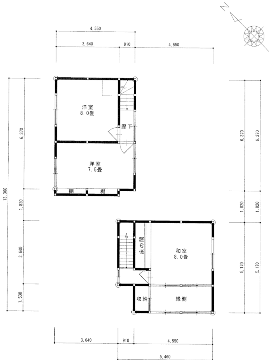
二階平面図 S = 1/100